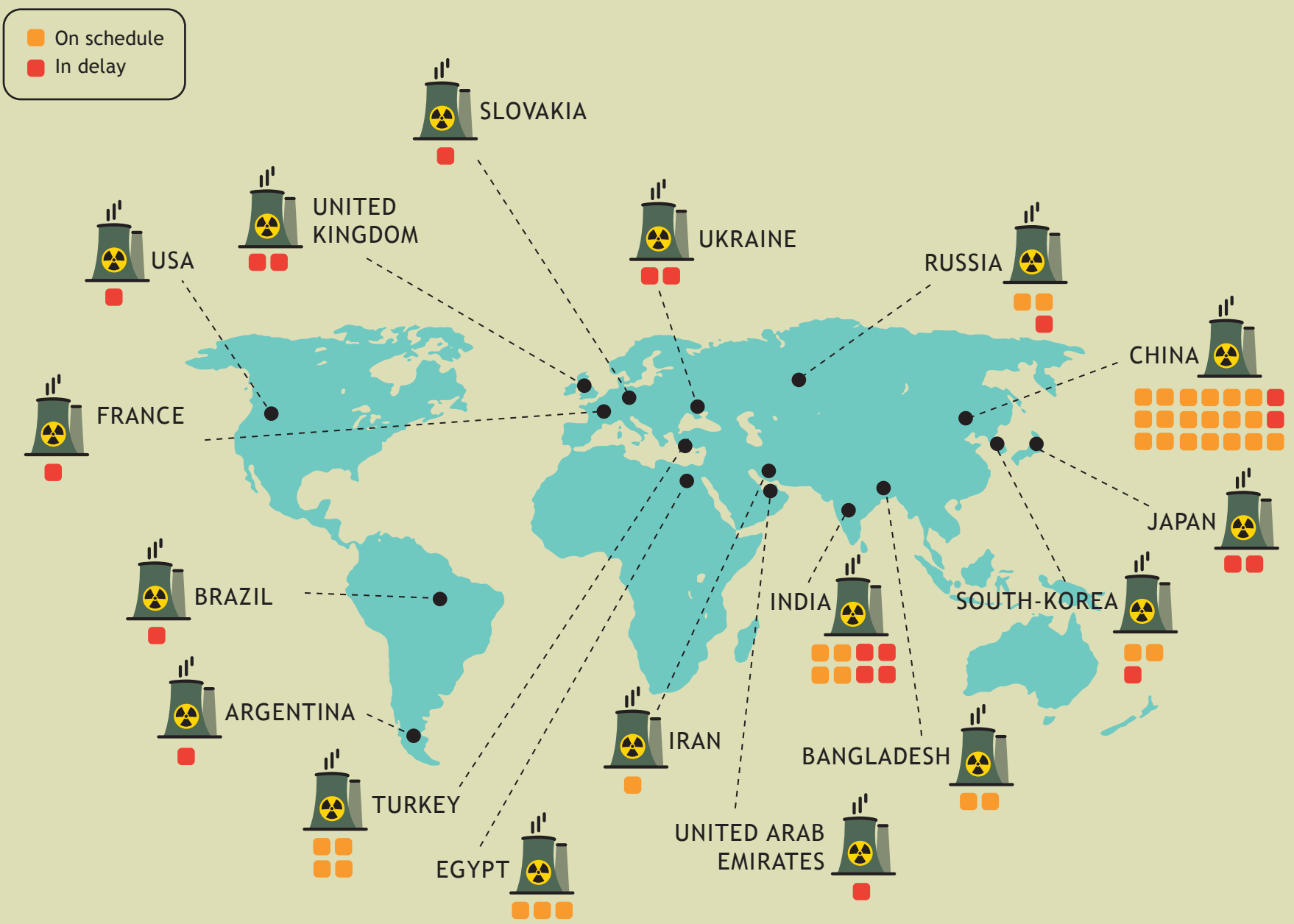
Construction start dates by country, and the extent of delays (if any)

17 countries are currently building nuclear power plants: the map shows where and how many are being built and how many are in delay